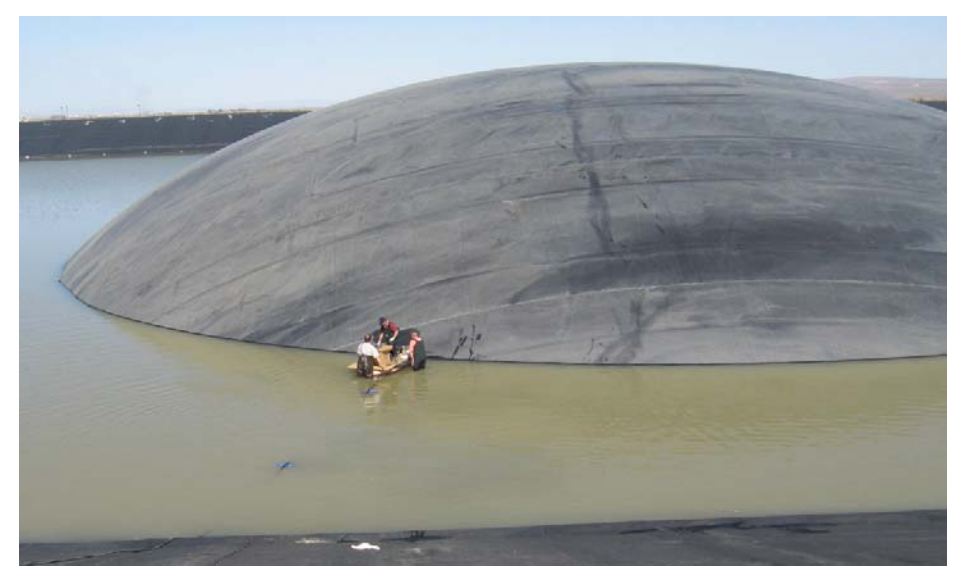
Figure 1: Example of large geomembrane gas bubble (note people in photo for scale).

ther not present or do not function; and equations and guidance to specify the minimum pond bottom slope needed to create the unbalanced hydrostatic forces required to induce bubbles to move to the perimeter slope where they can be vented.